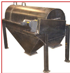
Fabricated Rotary Grain Cleaner