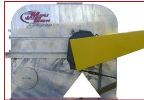
Galvanized Steel Custom Head Cover