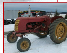
Completely Refurbished Tractor